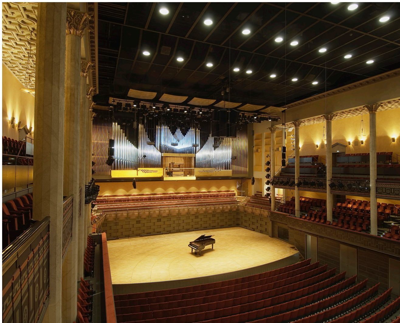
The Main Hall at Konserthuset Stockholm.