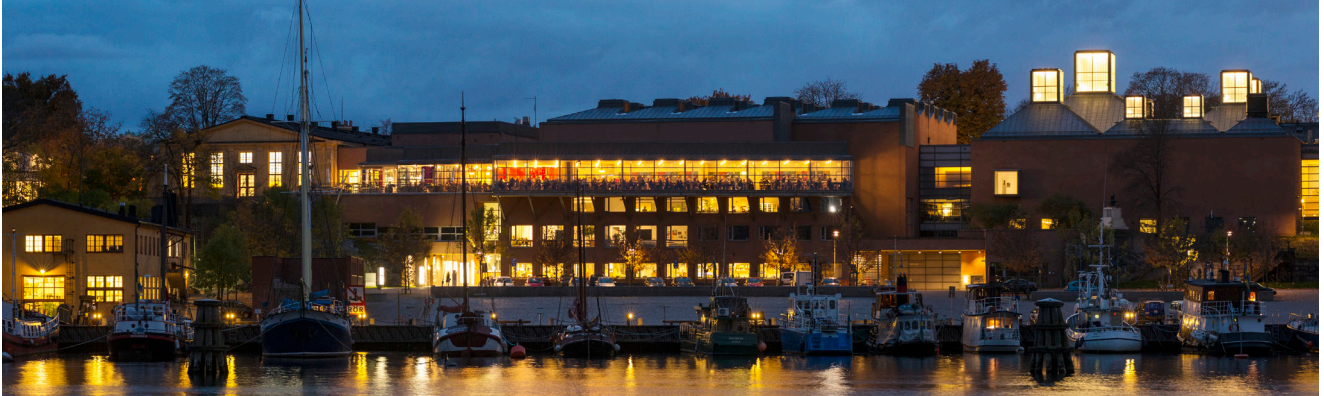
Moderna Museet.