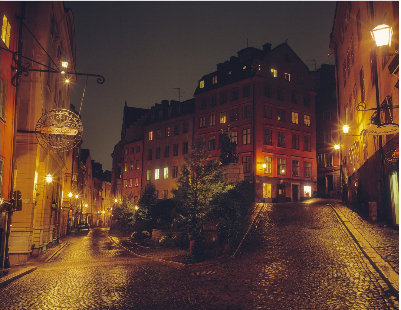
Old Town at night.