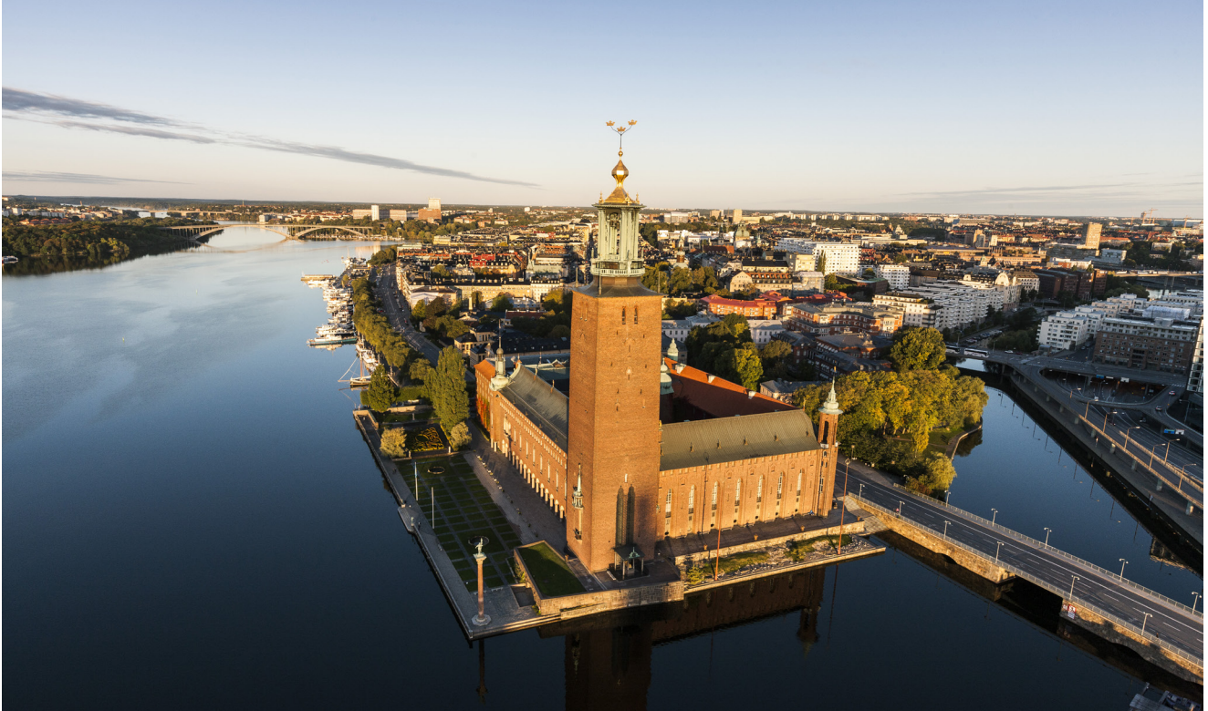
City Hall from above.